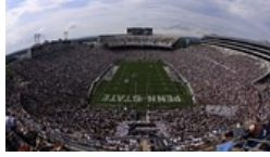
NCAA Lifts Penn State's Postseason Ban