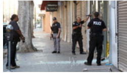
Agents Raid L.A. Garment Businesses