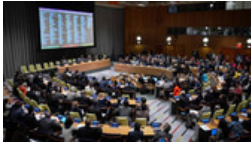
Foreign Policy Is Election Wildcard