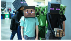
Minecraft Fans Fear Microsoft