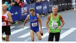
Marathon, Meh, Try Running a Mile