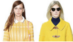
Fashion Gets Emotional